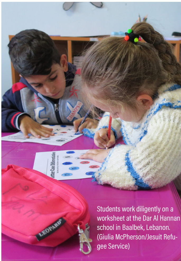
Students work diligently on a worksheet at the Dar Al Hannan school in Baalbek, Lebanon.

JRS Lebanon has also found that when these barriers are addressed, through support services for both students and their families – literacy, life skills, home visits, Youth Clubs, awareness sessions, counseling, and support groups – children are more likely to both come and stay in school.