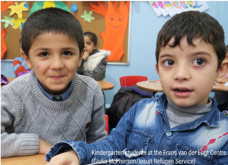
Kindergarten students at the Frans van der Lugt Centre.