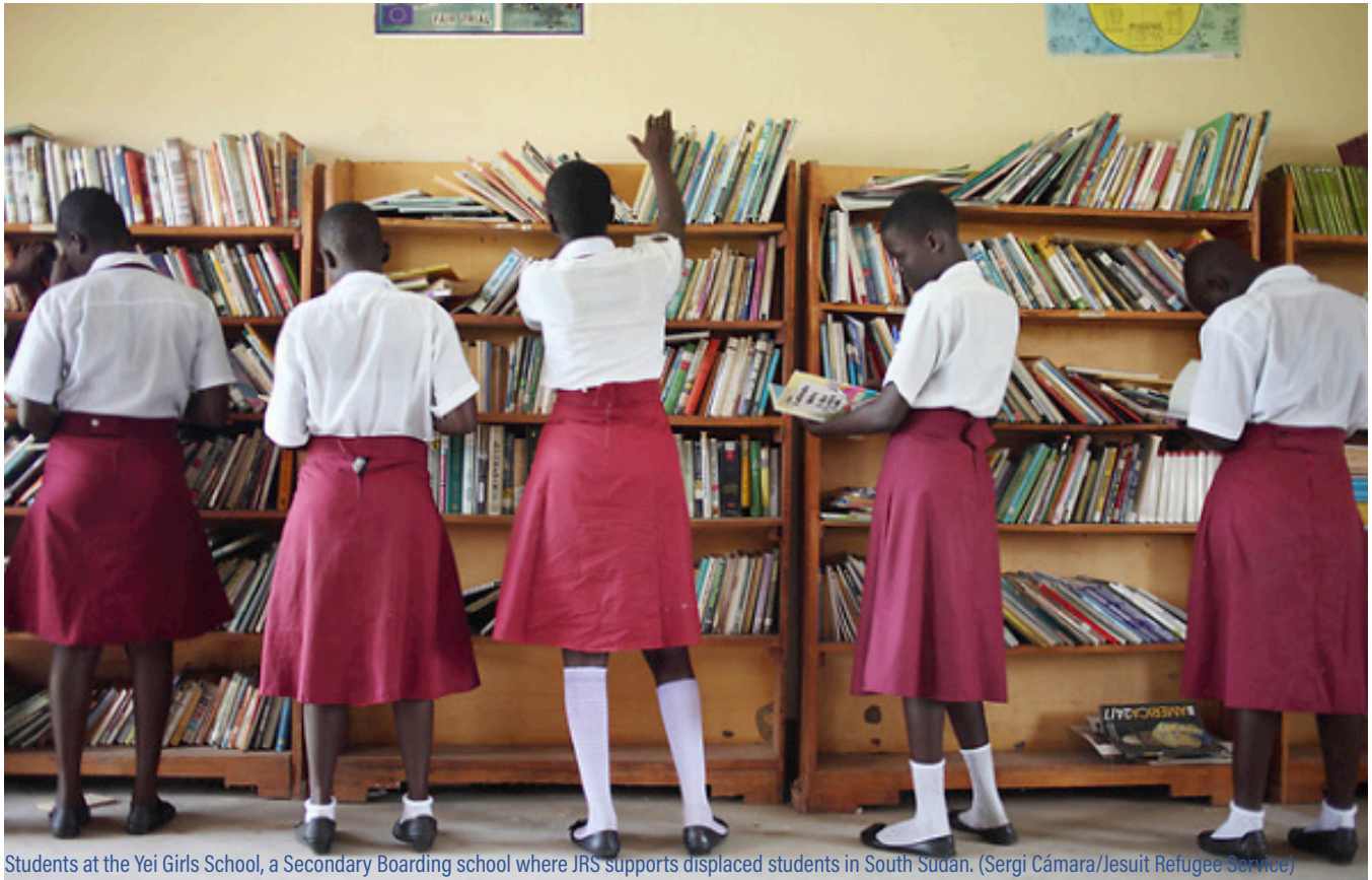
Students at the Yei Girls School, a Secondary Boarding school where JRS supports displaced students in South Sudan.