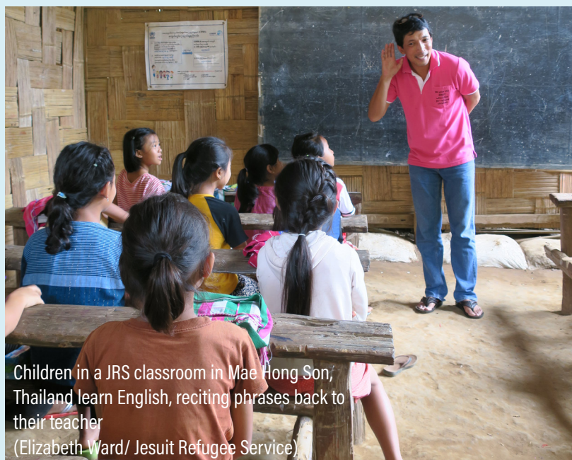
Children in a JRS classroom in Mae Hong Son, Thailand learn English, reciting phrases back to their teacher

In 2015, JRS launched a Global Education Initiative to increase its focus and investment in education programs. By 2020, we hope to open the doors of education to a quarter of a million students at a cost of $35 million.