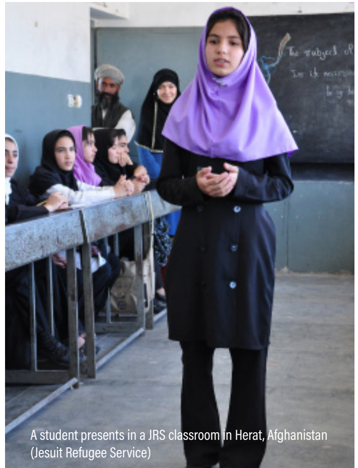
A student presents in a JRS classroom in Herat, Afghanistan (Jesuit Refugee Service)

ONLY 2.7% OF HUMANITARIAN AID DOLLARS ARE SPENT ON EDUCATION