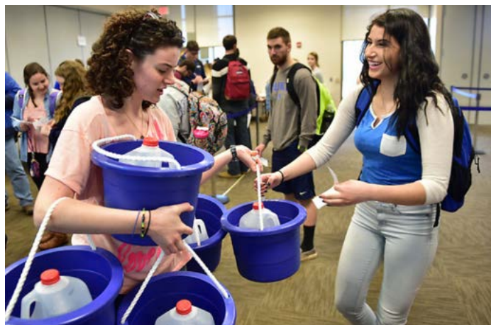
Students at Misericordia University in Pennsylvania get a sense of what it is like to gather and carry water in a refugee camp.