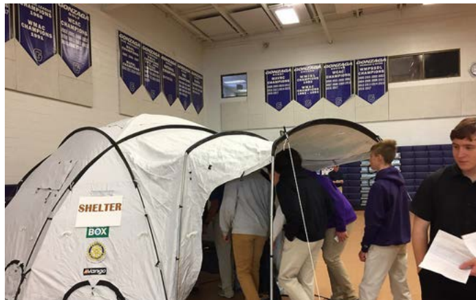
Students at Gonzaga College High School in Washington, D.C. walk through the shelter station during Walk a Mile.

In addition to the toolkit, JRS will provide outreach materials, media support, and advocacy suggestions.