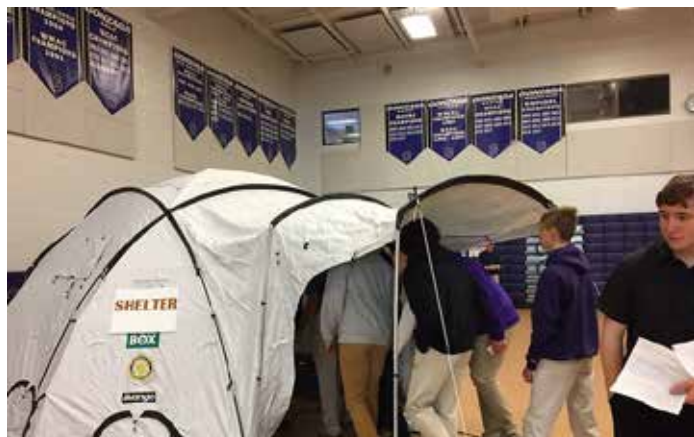
Students at Gonzaga College High School in Washington, D.C. walk through the shelter station during Walk a Mile.

In addition to the toolkit, JRS will provide outreach materials, media support, and advocacy suggestions.