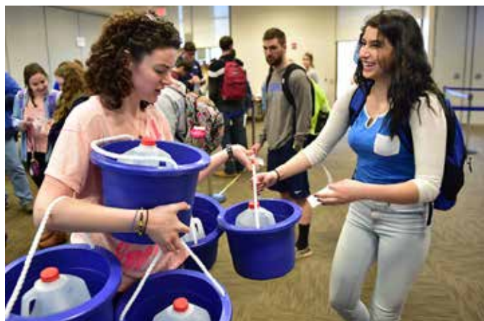
Students at Misericordia University in Pennsylvania get a sense of what it is like to gather and carry water in a refugee camp.