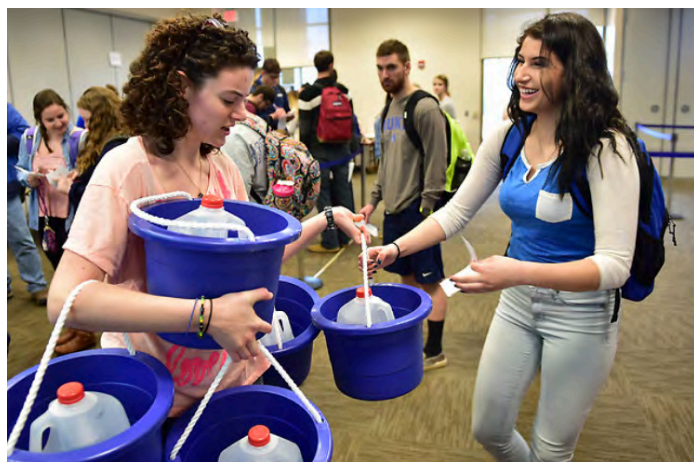
Students at Misericordia University in Pennsylvania get a sense of what it is like to gather and carry water in a refugee camp.