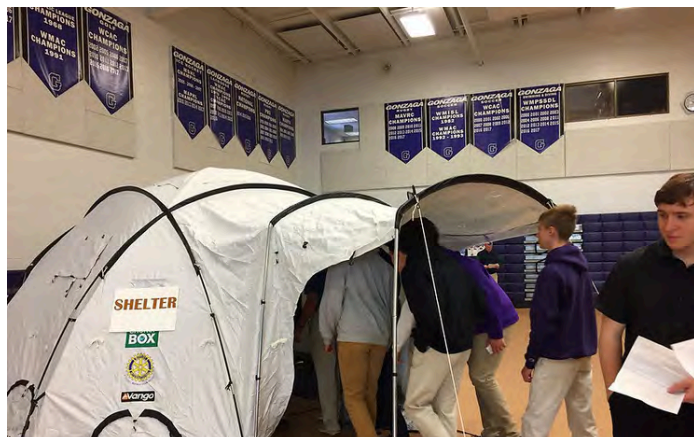
Students at Gonzaga College High School in Washington, D.C. walk through the shelter station during Walk a Mile.

In addition to the toolkit, JRS will provide outreach materials, media support, and advocacy suggestions.