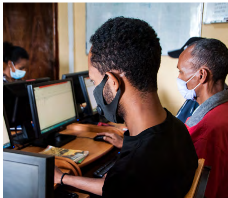
JRS offers English, information technology, and music classes to refugees in Ethiopia.