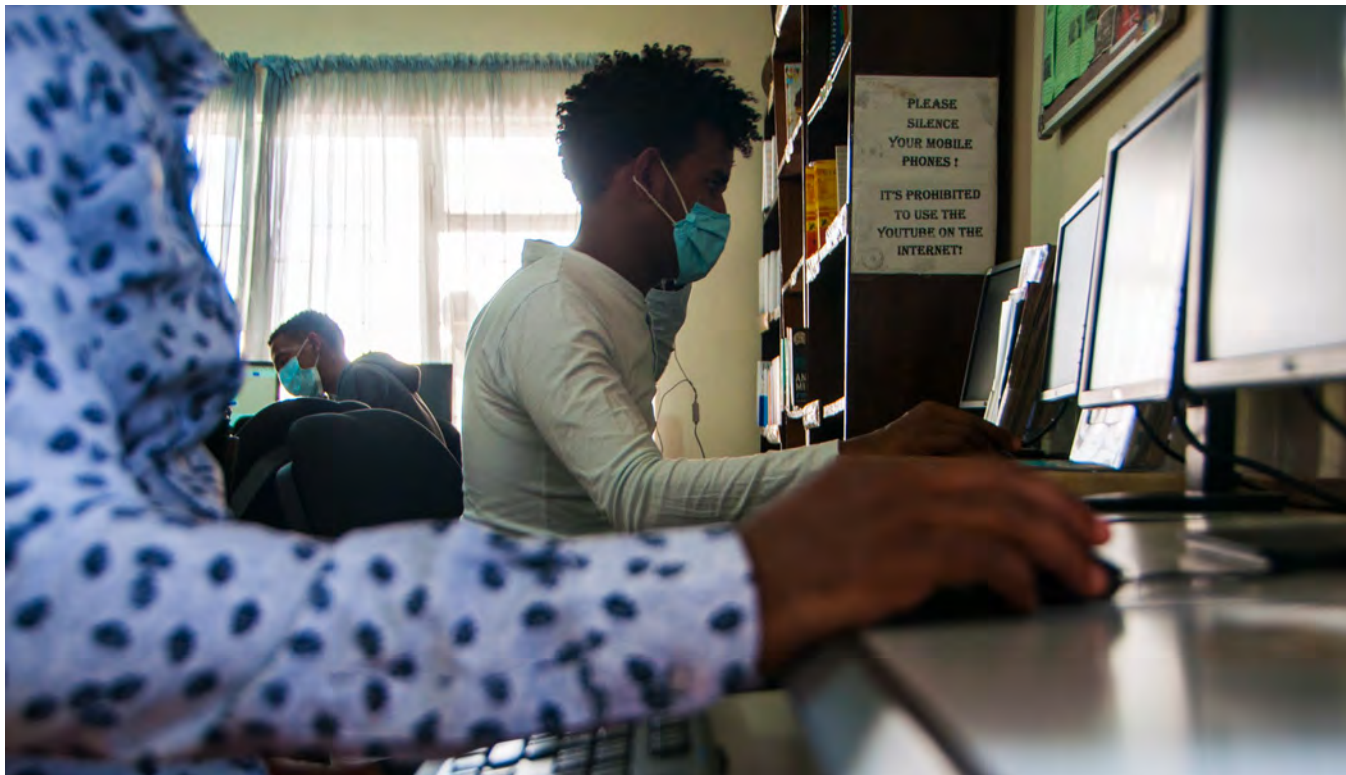
Refugee students take an English language placement test in Ethiopia.