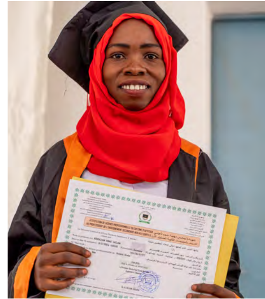
Graduation ceremony for refugee students in Abeche, Eastern Chad after completing a teacher training program.

For the past two years, the challenges refugees face have been further exacerbated by the COVID-19 pandemic. Yet, raising the level of refugee participation in higher education over the coming years represents an ambitious but feasible goal.