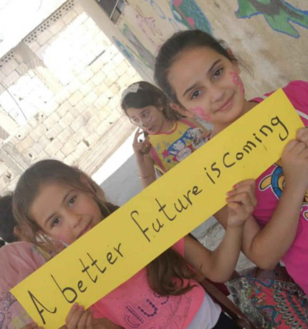
Students at a JRS school in Baalbek, Lebanon, a program supported by JRS/USA donors.