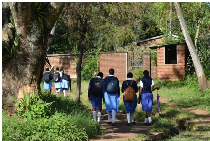
Naweza boarding school scholarship