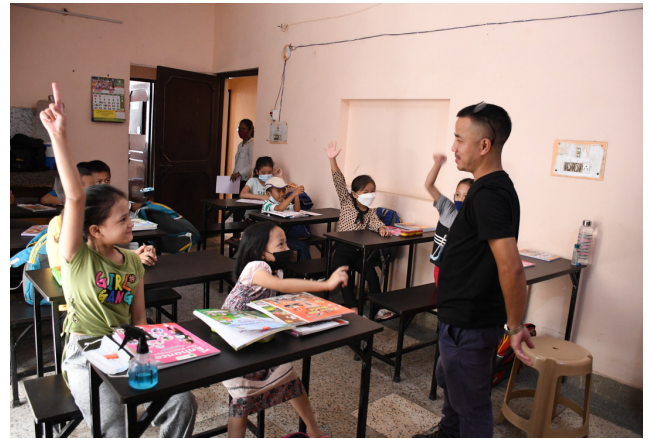
Urban refugee children participating in JRS India's elementary school programs in New Delhi.