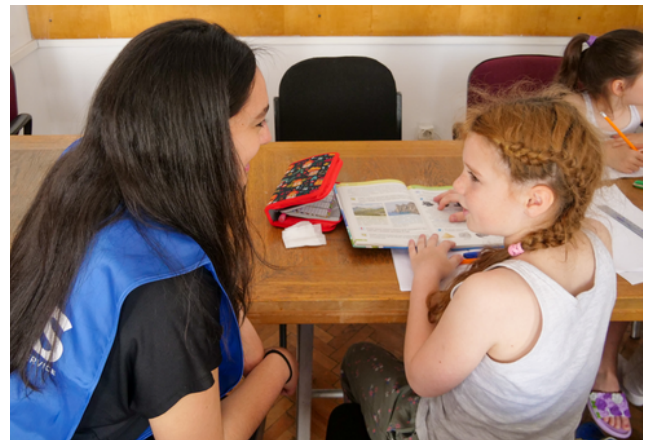
Displaced Ukrainian children receiving education services from JRS Staff in Romania.

Your support and investment makes these programs and opportunities possible. Thank you.