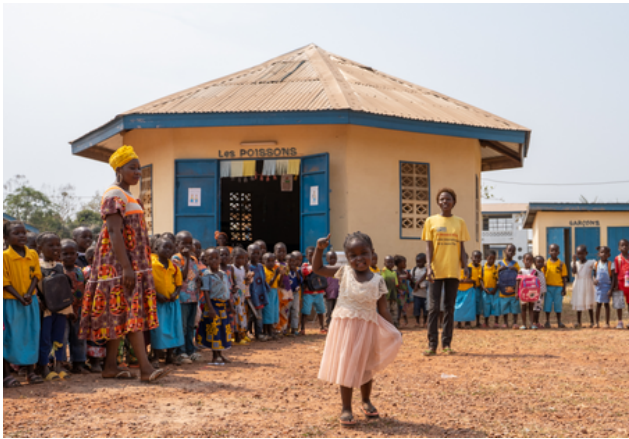
Children participating in JRS CAR's pre-school education programs in Bangui.