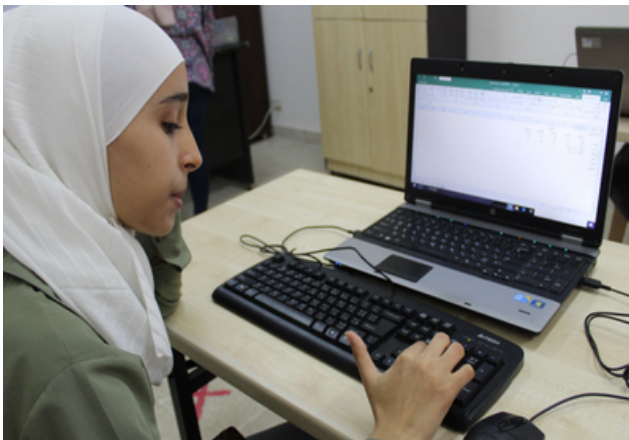
Young woman partaking in JRS Syria's computer classes offered in the education center in Jaramana.