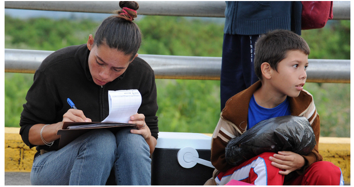
Venezuelan migrants crossing the border into the United States.

Most notably, individuals JRS has encountered in Ciudad Juárez have reported being kidnapped in different states in Mexico, including Chiapas, Veracruz, Coahuila, Durango, and Chihuahua. The frequency of these reports has increased in recent months, as hundreds of individuals have shared their experiences of being arbitrarily captured, detained against their will, and deprived of liberty for indefinite periods of time until ransom is paid. This is a disturbing trend, as armed criminal groups make a profit by targeting migrants and asylum seekers.