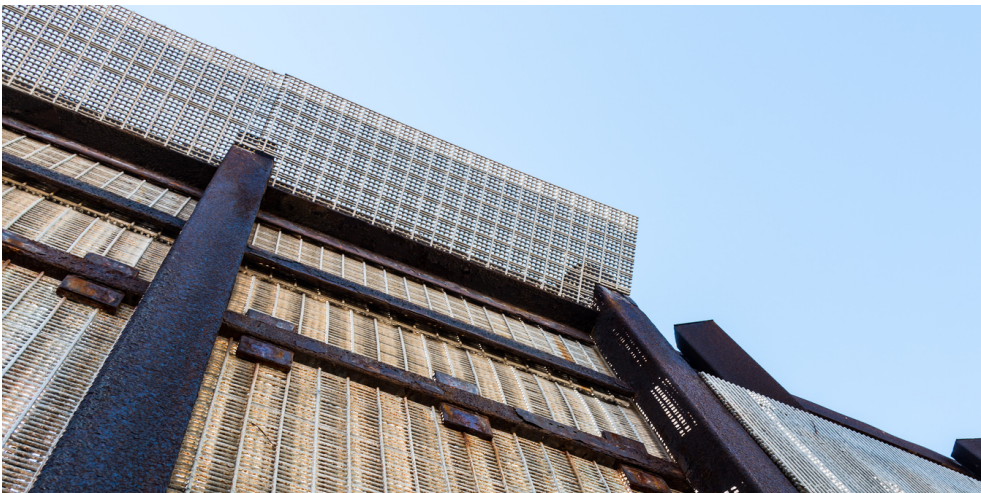
Shared border of U.S. and Mexico.

Once in El Paso, asylum seekers then face the challenge of getting to their next destination within the U.S. With limited funds for airline or bus tickets, many depend upon financial support from friends, families, or humanitarian organizations to help them along their way. Shelter staff and volunteers, including JRS/USA staff, help asylum seekers navigate the U.S. transit system by pointing them in the direction of airlines and bus companies that will bring them to their anticipated destination. As one shelter volunteer put it, asylum seekers have “one job: to get a ticket elsewhere.”