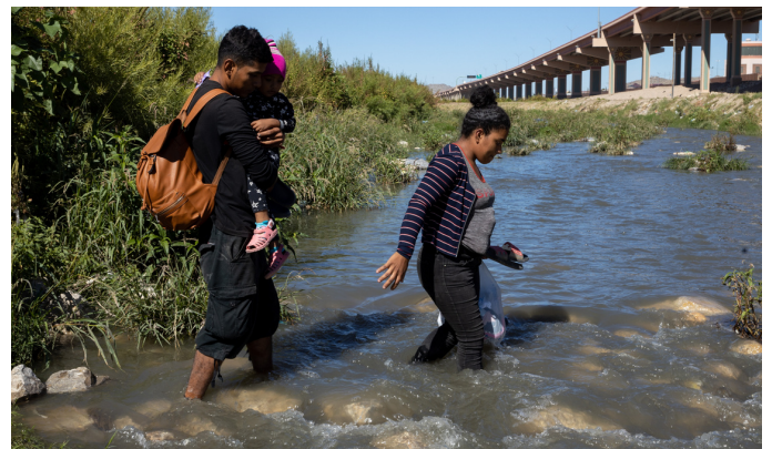
Migrant family crossing into the United States.

JRS’s binational humanitarian response ensures that those who experience the dehumanizing process of journeying to and arriving at the U.S.-Mexico border are welcomed with dignity and treated with respect. In this report, with information sourced from interviews and visits to shelters in Ciudad Juárez and El Paso in summer 2023, JRS/USA and JRS Mexico present a snapshot of current conditions in Ciudad Juárez and El Paso and how U.S. policies adversely impact protection, mental health, and public health challenges.