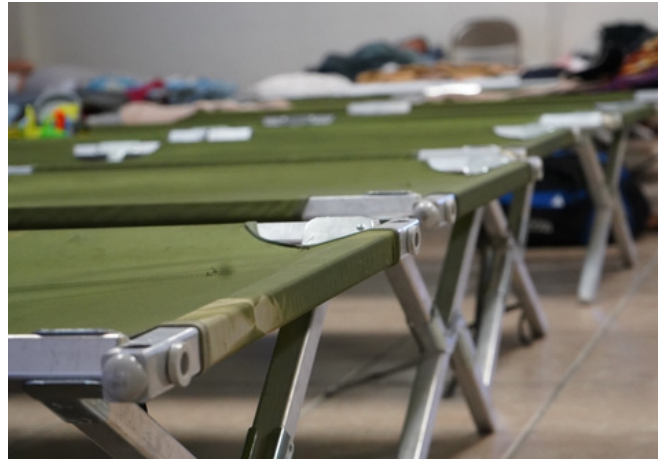
Migrant shelter in El Paso, Texas.

Individuals and families who manage to get a CBP One appointment and pass the initial inspection interview are then processed by CBP and released into border towns like El Paso while they wait for their asylum hearing.